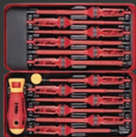
Bondhus® Felo 53439 E-Smart Screwdriver Set, 14 piece