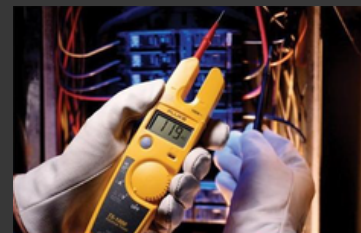
Fluke® T5-600-USA Electrical Clamp MEter, 0 to 600 VAC/VDC Supply, 1.5% +/-2 Count AC/1% +/-1 Count DC Accuracy, 1000 Ohm Resistance

To register, please contact Tyler Perry at tperry@smcelectric.com